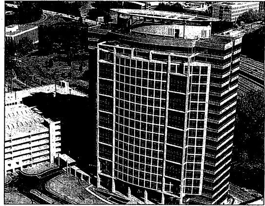
Glenridge Highlands Two: Harcon Inc.'s work on the 20-story office building included an elliptical 'halo' that is positioned about 30 feet above the roof.

Specialty Contractor Award Winner $1 million to $5 million